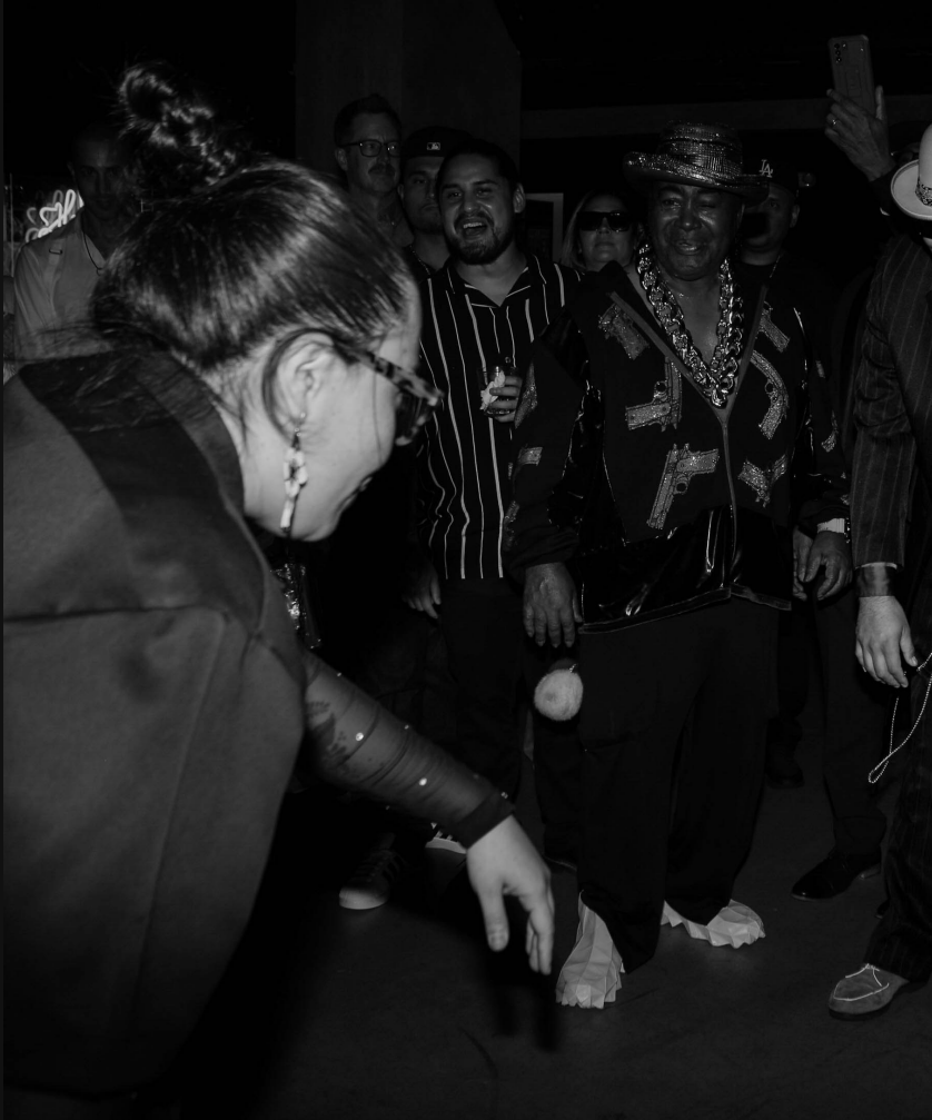
Community ceremony — Los Angeles