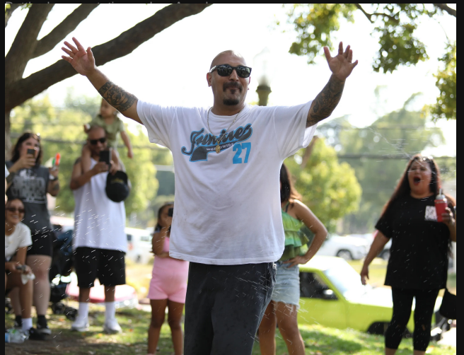
Community gathering — Los Angeles