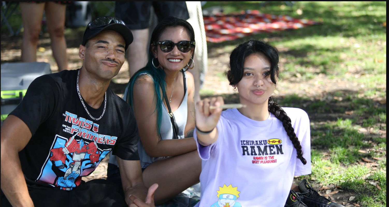
Park event — Los Angeles